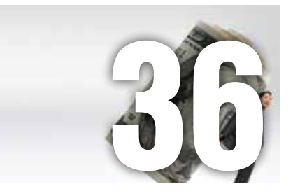
Positive Effects of Covid-19 on the Debt Collection Market in Turkey