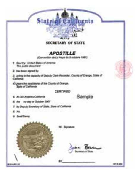
Apostille from the California Secretary of State

6) Authentication. A letter rogatory must be certified or authenticated. When possible, present original documents, that is, those that the issuing judge and clerk sign. The clerk must certify or attest that the documents and exhibits are a true and correct copy from the case file. A Mexican judge will want to see all documents that are integral to the file, so make sure that all pages in the exhibits are referenced in the certification.